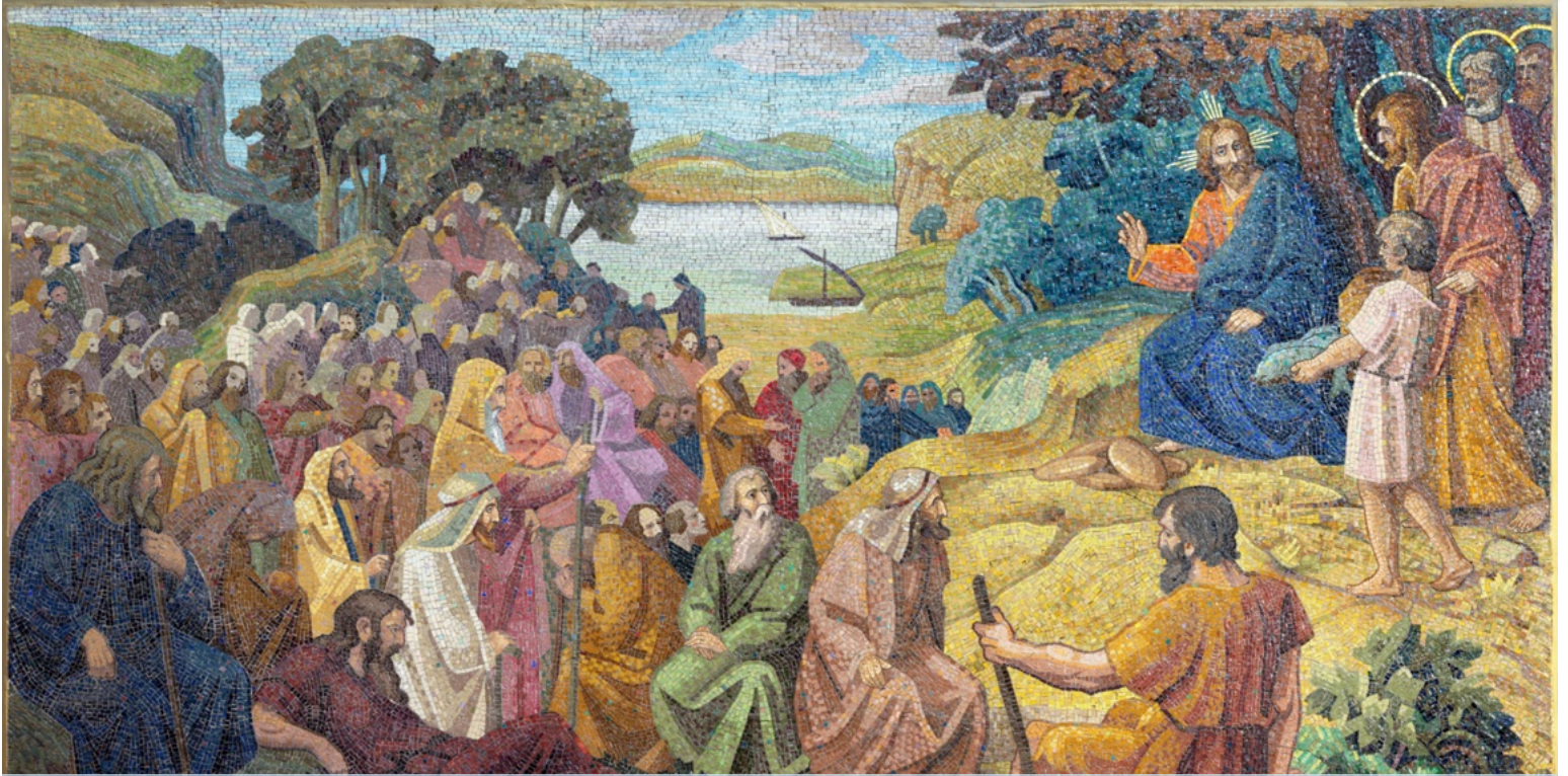
The Feeding of the Multitude